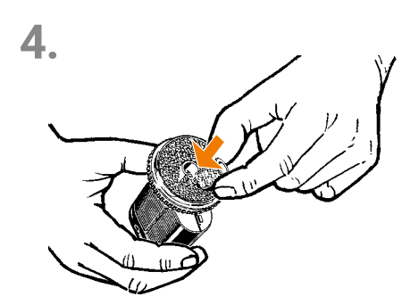
Fill Filling Chamber with Filling Aid