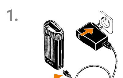
Please charge the CRAFTY Vaporizer before use