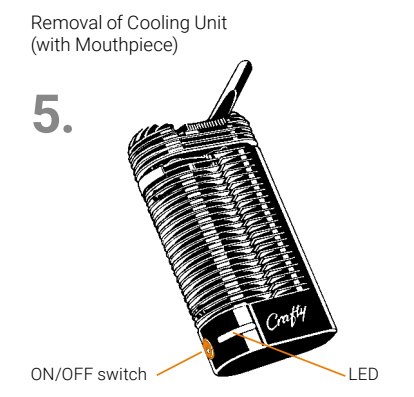
Switch on CRAFTY Vaporizer Red LED = Heating up; Green LED = Ready for use

Refer to the Instructions for Use for important safety and user advice. Do not operate the device without first reading and understanding the Instructions for Use!